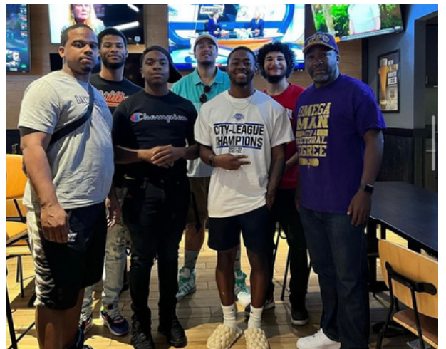
MBK Dayton university send off for the class of 20-21 & 21-22 DPS Males of Color

MBK Dayton and Dayton Public Schools Cultural Engagement and Inclusion hosted several pop-up kickball games for students throughout the month of July.