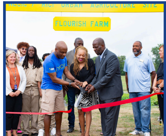
2024 flourish Farm Ribbon Cutting