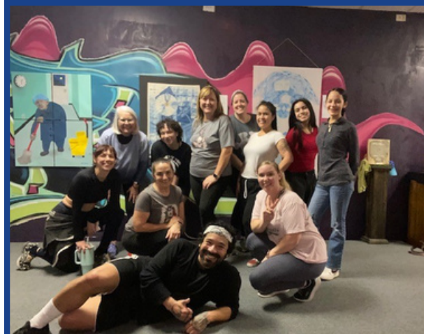
Dance Fitness Class at La Luna