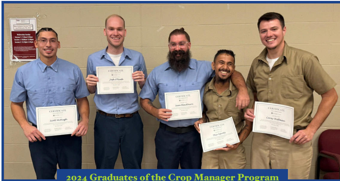
2024 Graduates of the Crop Manager Program