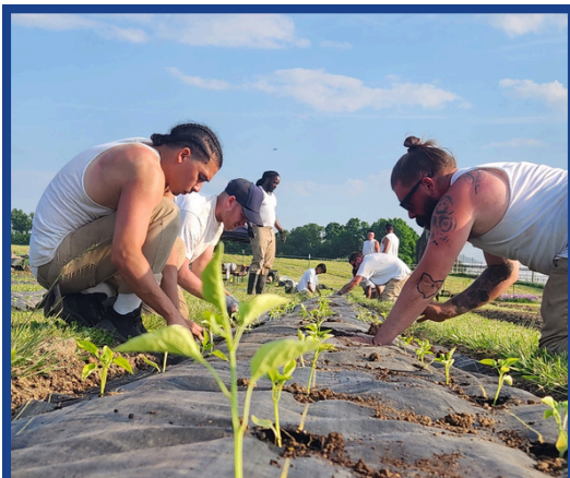
Crop Planting at Flourish Farms

As we look ahead, the Flourish Farms program continues to grow. The 2025 group began their training in March, starting with classroom learning before they will move outdoors as the weather warms up. With each season, this initiative continues to cultivate not just crops, but also knowledge, opportunity, and a brighter future for all those involved.